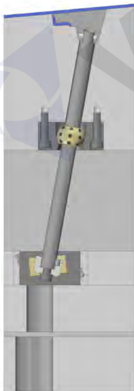
Accelerated Lifter travel

VF5 Universal Lifter is designed release undercuts upto 10^\circ with acceleration and deceleration. For lifting angles greater than 10^\circ , use VF6 Universal Lifter. Configure your own lifter by selecting components from the following pages.