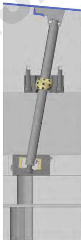
Decelerated Lifter travel